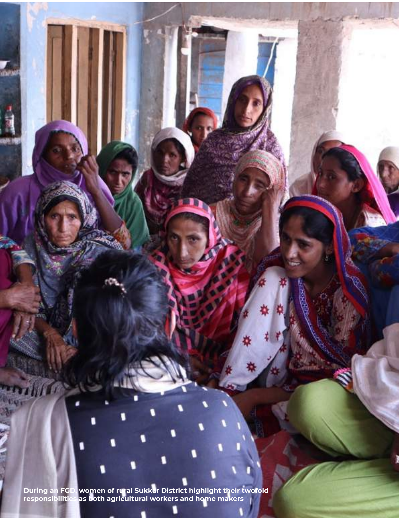
During an FGD, women of rural Sukkur District highlight their twofold responsibilities as both agricultural workers and home makers