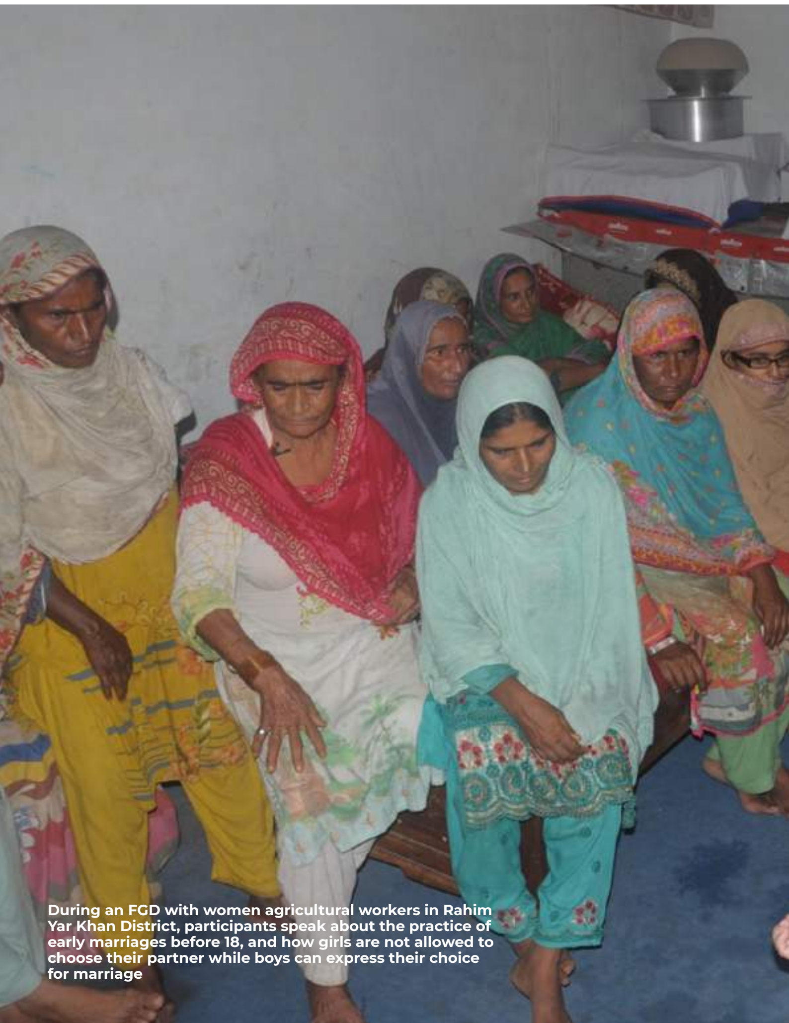
During an FGD with women agricultural workers in Rahim Yar Khan District, participants speak about the practice of early marriages before 18, and how girls are not allowed to choose their partner while boys can express their choice for marriage