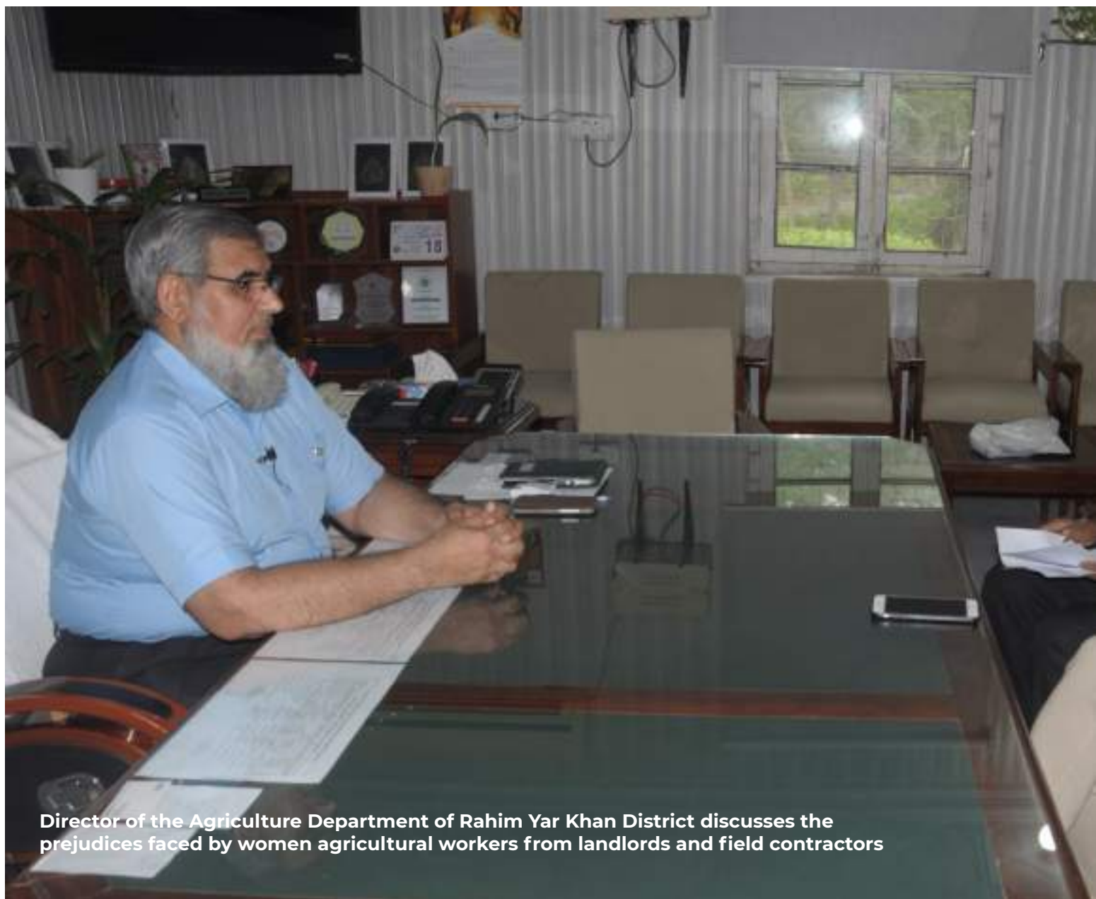
Director of the Agriculture Department of Rahim Yar Khan District discusses the prejudices faced by women agricultural workers from landlords and field contractors

The traditional roles of female and male agricultural workers are different. Both in Sindh and Punjab, the men prepare land for crops, use tractors or technology to sow seeds, irrigate using canal systems, and use machines to spray pesticides. The women, on the other hand, are mostly engaged in weeding, removing waste stubble and taking care of crops, but are not allowed to harvest. The men in Sindh make crop-sharing arrangements and agreements with landlords, while the women do not. The Director of the Agriculture Department disclosed that in rural areas, only women pick cotton because it is considered a woman's job due to prevailing patriarchal mindsets.