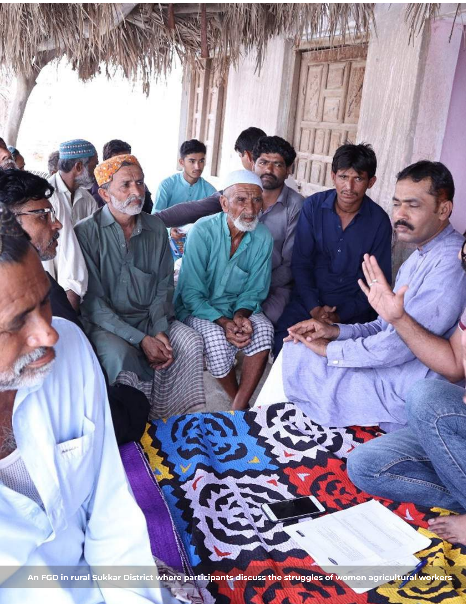
An FGD in rural Sukkar District where participants discuss the struggles of women agricultural workers