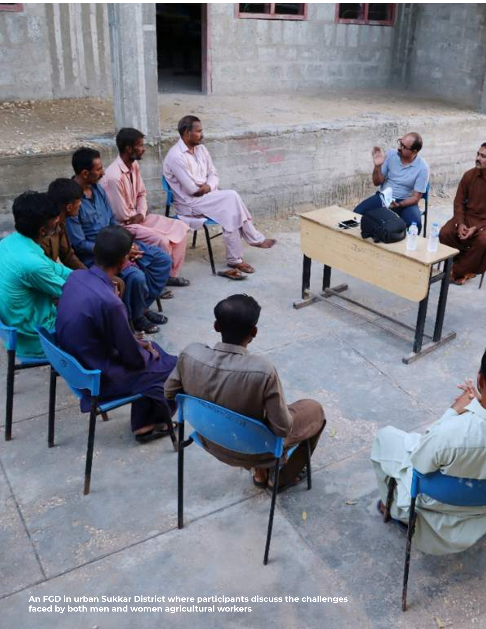
An FGD in urban Sukkar District where participants discuss the challenges faced by both men and women agricultural workers