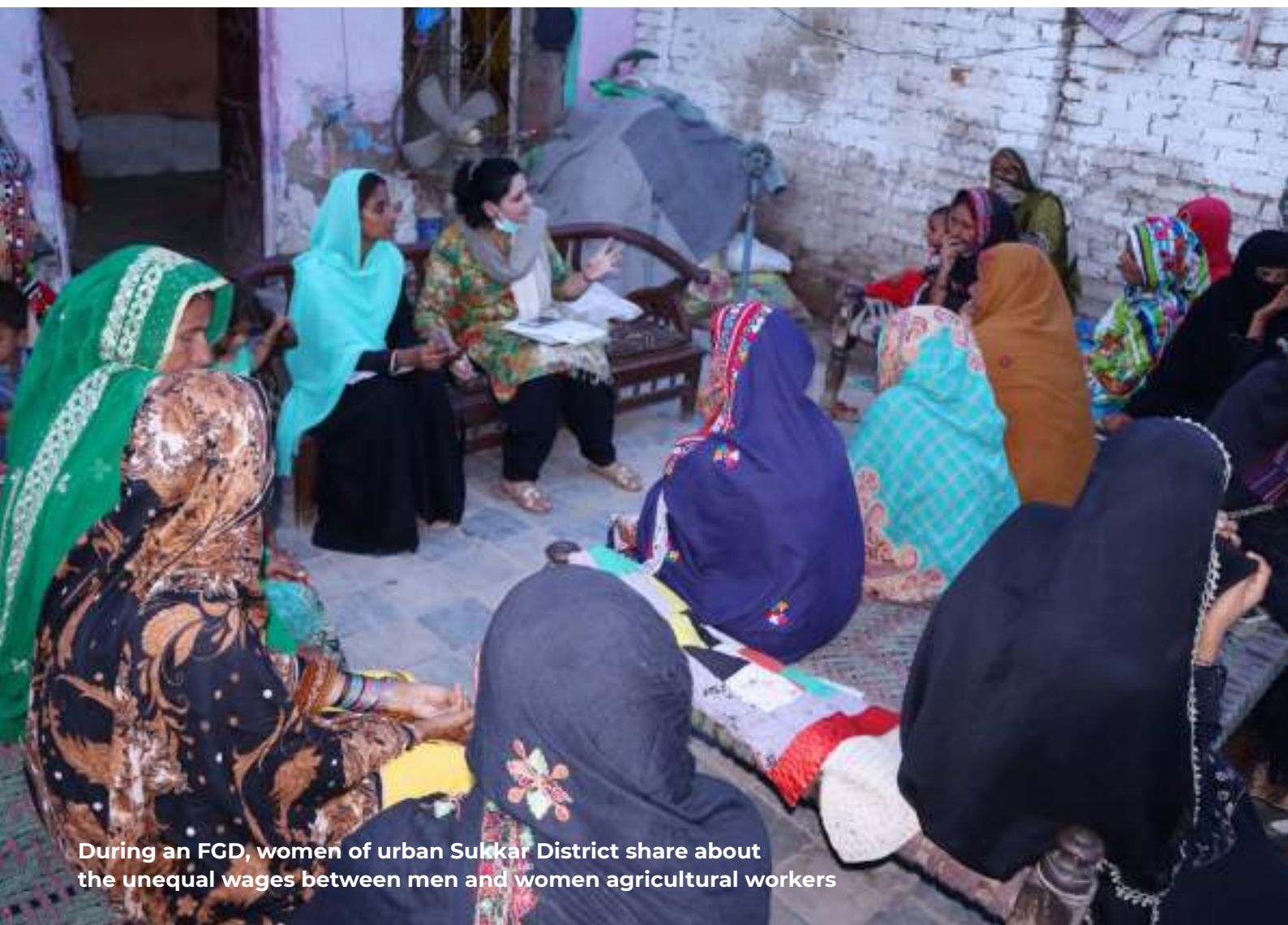
During an FGD, women of urban Sukkar District share about the unequal wages between men and women agricultural workers

boards in the province. 19 which has empowered the women working in the agricultural sector there, but such an Act is yet to be passed in Punjab and other provinces. Furthermore, the quality and quantity of research related to women's issues is not sufficient and does not meet international standards. Large-scale surveys to identify problems facing rural women in different agroecological and socioeconomic zones need to be conducted to plan and implement programmes that address the issues and constraints faced by women vis-à-vis the agricultural sector.