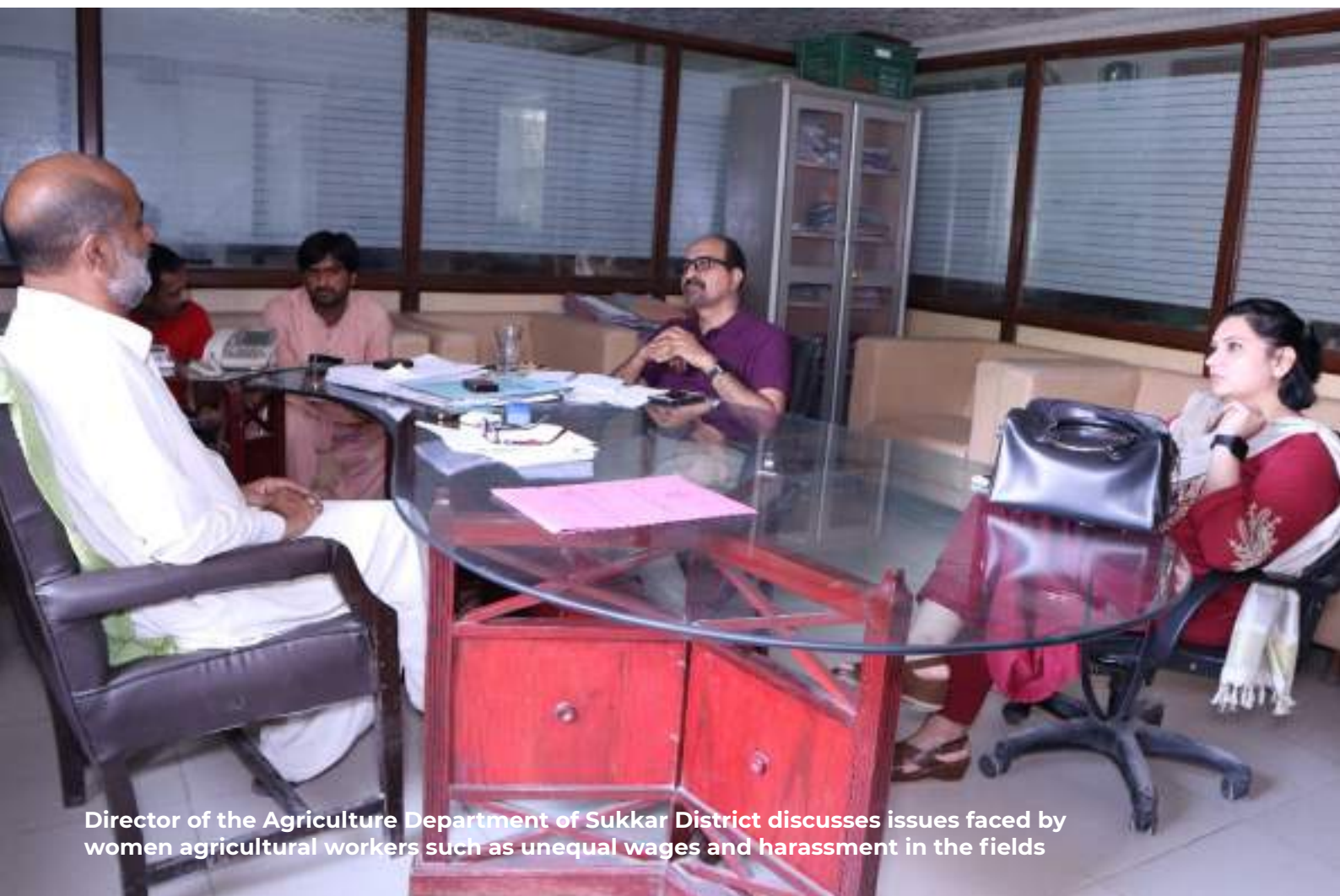
Director of the Agriculture Department of Sukkar District discusses issues faced by women agricultural workers such as unequal wages and harassment in the fields

to safety gear. The representative from the Agriculture Department concede that the sprays are indeed harmful; however, the Deputy General of the Welfare Department was of a different opinion, insisting that the sprays are not harmful. A representative from the Human Rights Commission of Sindh clarified that women in rural areas are neglected, and often do not receive proper nutritious diets, which results in poor health and leaves them prone to diseases. This, in turn, affects their productivity. She also expressed alarm over pregnant women being forced to carry out challenging work on farms, which is detrimental to both the women and their unborn children.