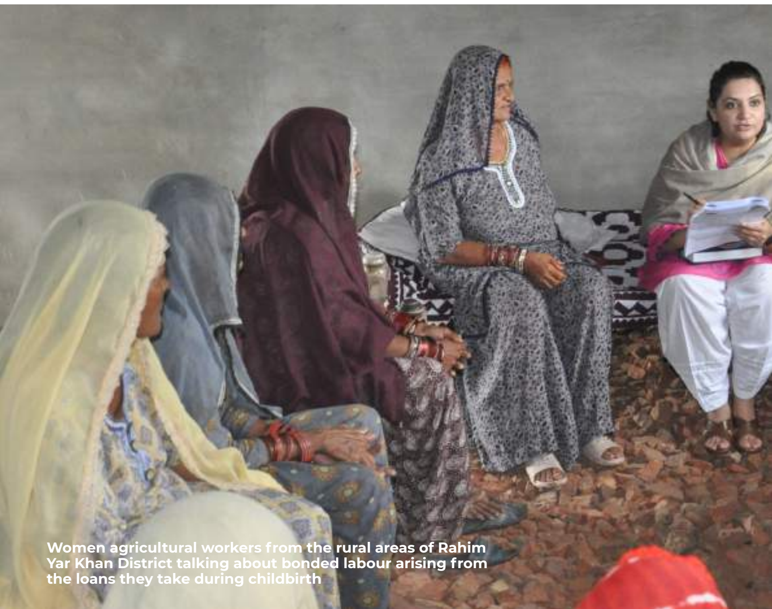
Women agricultural workers from the rural areas of Rahim Yar Khan District talking about bonded labour arising from the loans they take during childbirth

part, refused to recognise this issue, claiming that factory workers are paid equally, but they do not have data on WAWs due to in-field limitations.