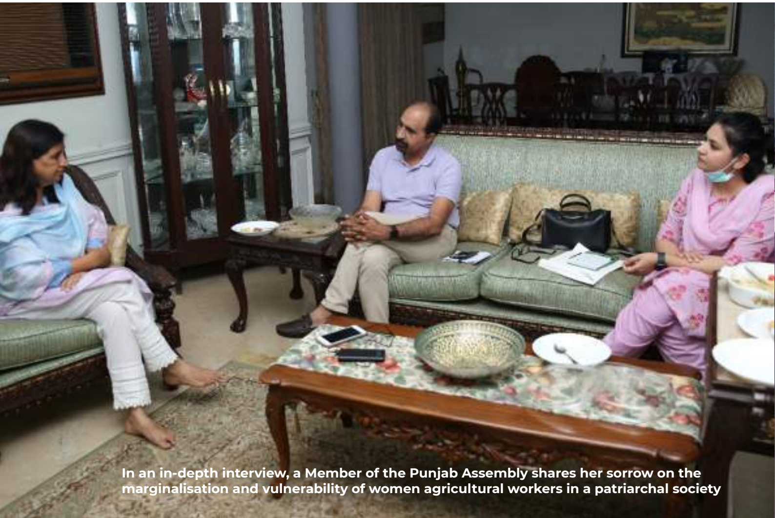
In an in-depth interview, a Member of the Punjab Assembly shares her sorrow on the marginalisation and vulnerability of women agricultural workers in a patriarchal society

marriages and other family functions. In Sindh, it was shocking to observe that males in rural areas do not work full-time, and are instead engaged in informal labour, only to squander their earnings on gambling. This alarming phenomenon further deteriorates household incomes and exacerbates already dire family economic conditions.