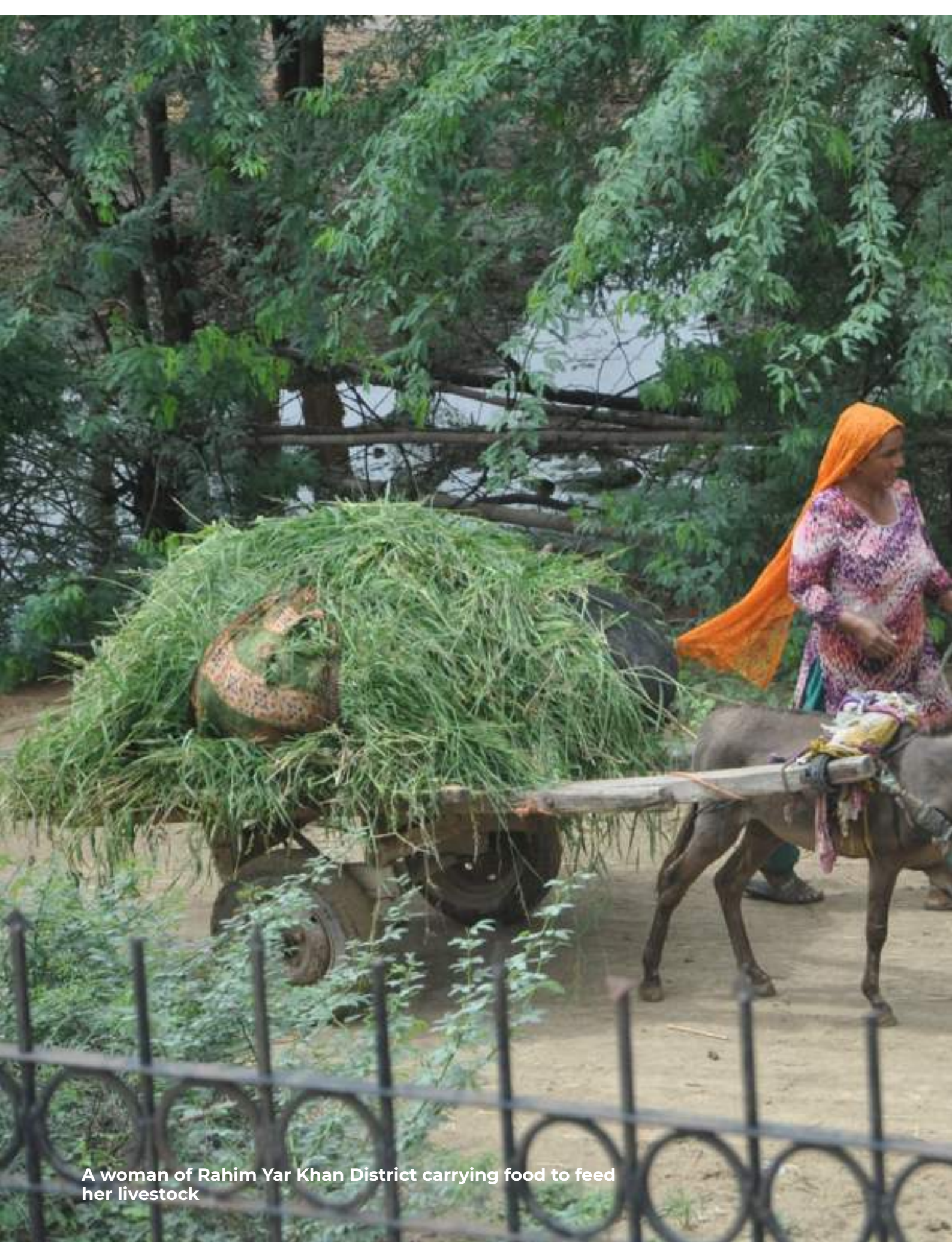
A woman of Rahim Yar Khan District carrying food to feed her livestock