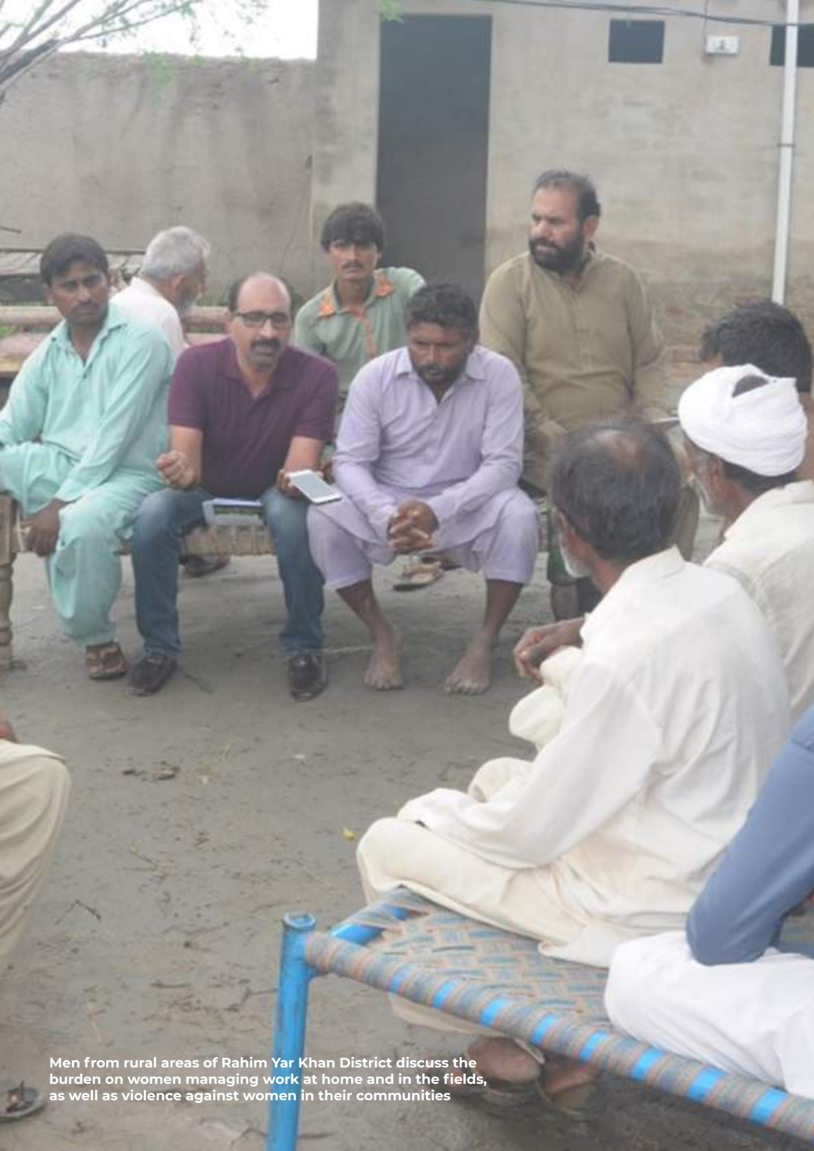
Men from rural areas of Rahim Yar Khan District discuss the burden on women managing work at home and in the fields, as well as violence against women in their communities