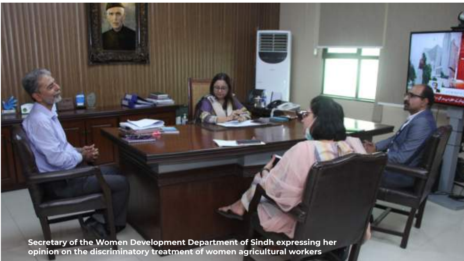
Secretary of the Women Development Department of Sindh expressing her opinion on the discriminatory treatment of women agricultural workers

women is part of a broader scheme of systemic gender inequality in the country. 22 Women are dominated not only by their husbands but also by male members of the family. The majority of women are deprived of their right to education.