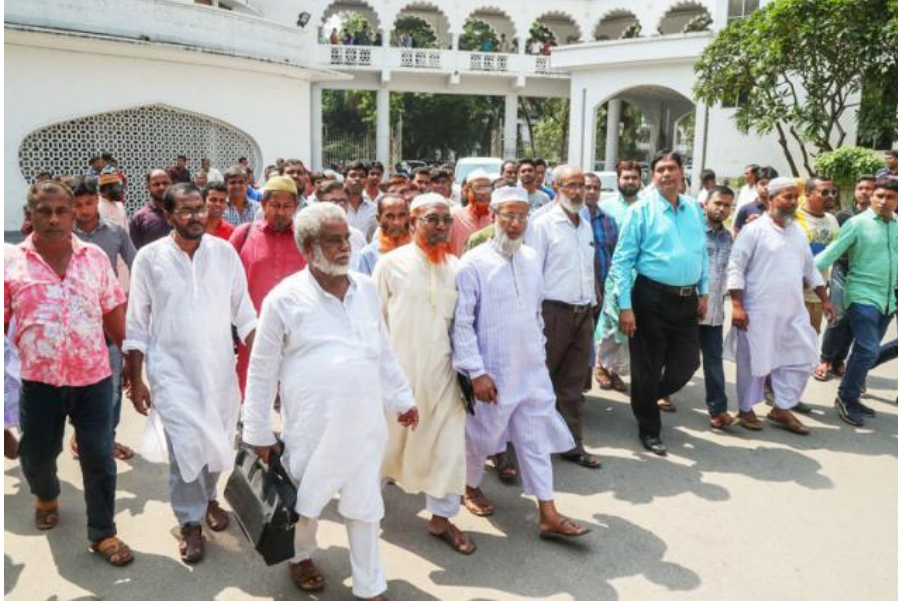
People from Jessore have come to the High Court for anticipatory bail on 'unauthorised' cases filed against them.