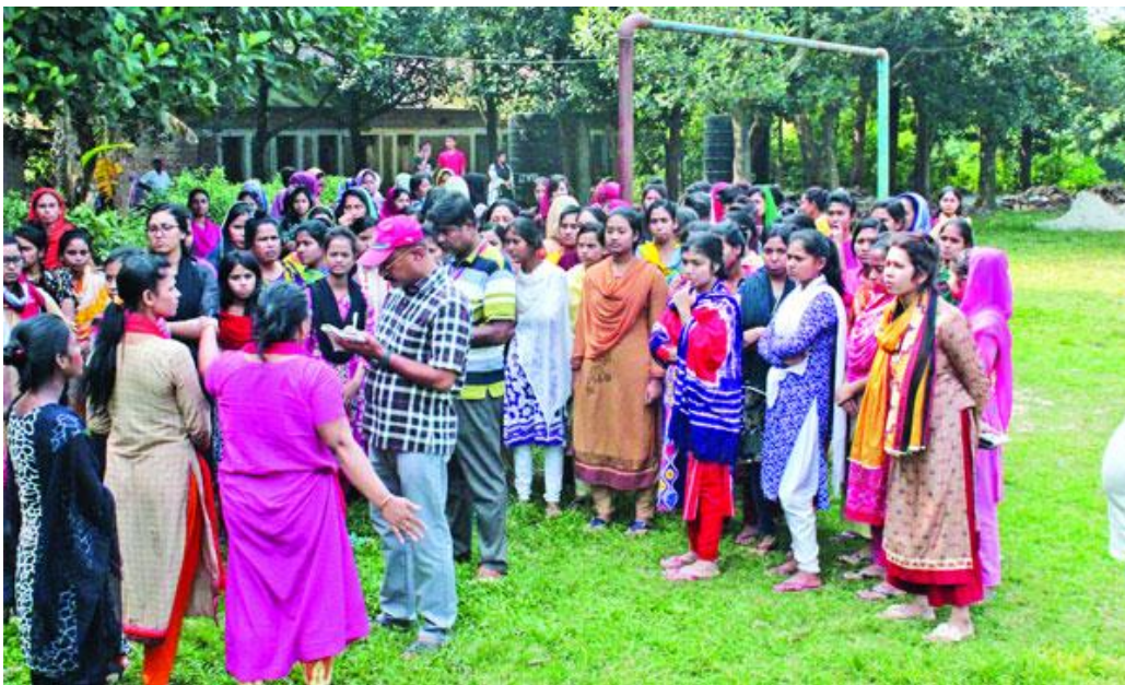
Journalists talking to the students at Gonoshashtha Kendra after the attack.

39. It is to be mentioned that dissenting citizens are being accused of ‘sedition’ due to their opinions against the wrongful actions of the government. According to the Fifteenth Amendment to Constitution, the highest punishment of sedition is the death sentence. Criminals affiliated to the ruling party or government who are involved in various criminal activities, are enjoying impunity.