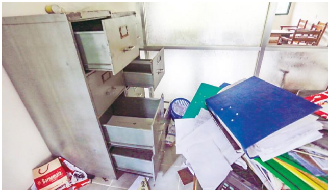
Criminals vandalised Gonoshasthaya Kendra at Ashulia. Photo: New Age 27 October 2018