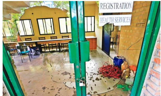
Female students' dormitories of Gonoshasthaya Kendra after attack. 27 October 2018