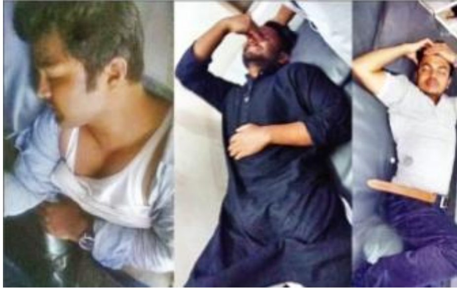
Dhaka University students wounded by Chhatra League activists.