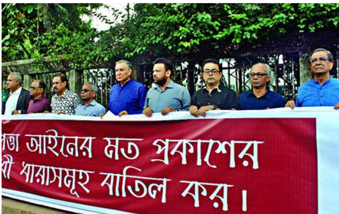
The Editors Council organised a human chain in front of the National Press Club and demanded the amendment of the Digital Security Act. Photo: Manabzamin, 16 October 2018