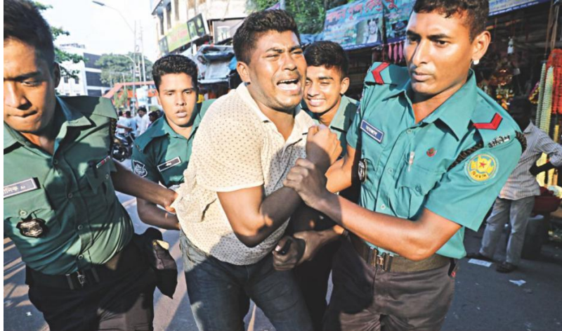
A BNP activist, who was on his way to the rally, protests while being dragged away by police from Shahbagh area in Dhaka.