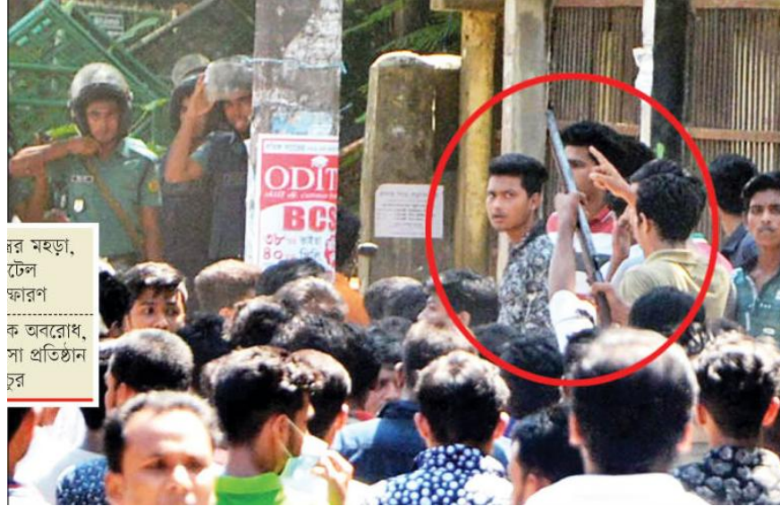
Chhatra League activists in front of Haji Mohsin College in Chittagong carrying firearms in the presence of police.