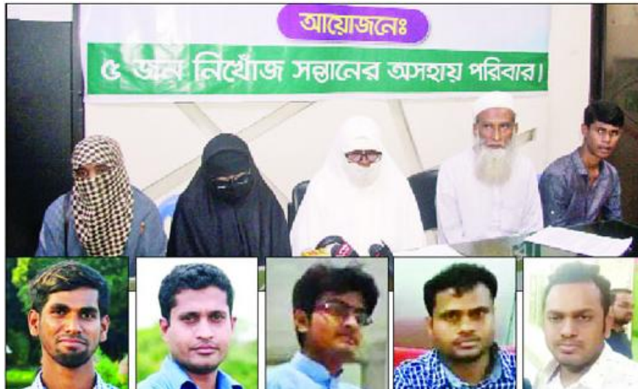
The families of the disappeared organised a press conference to demand the whereabouts of the five youth allegedly picked up by DB Police. Photo: Naya Dignata, 16 September 2018

disappeared contacted different police stations, DB office but police denied the arrest of the five. 72 Later on, on 27 September the five youth were produced before the court under a case filed at the Wari Police Station under the Explosives Act 1908. 73