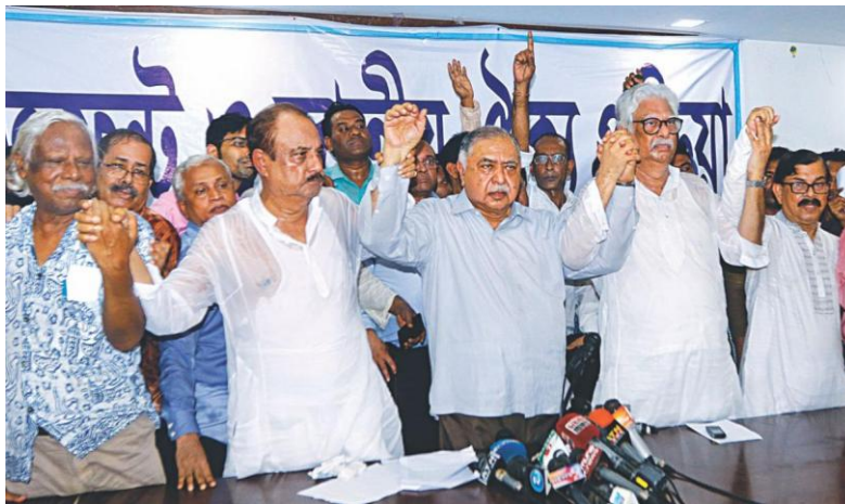
Juktafront and Jatiya Oikya Prokriya formally announce the formation of an alliance named "Greater National Unity" at a programme at the Jatiya Press Club. Photo: The Daily Star, 16 September 2018