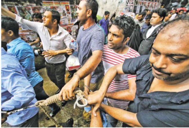
Arrested BNP leaders-activist, who had been demanding a better treatment and release of Khaleda Zia, produced in Dhaka Chief Metropolitan Court.