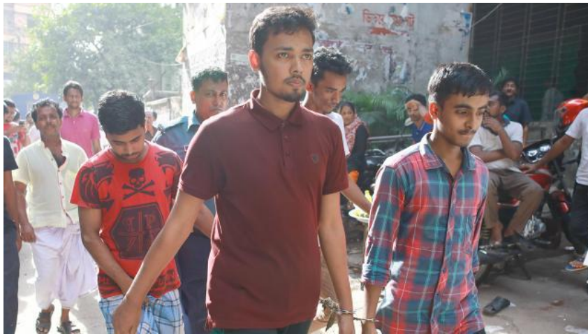
Some of the 12 students produced before the Chief Metropolitan Magistrate Court on allegations of blocking government work.