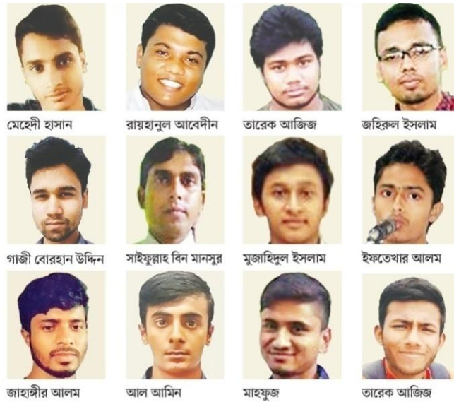
The 12 students allegedly detained in DB office. Photo: Prothom Alo, 10 September 2018