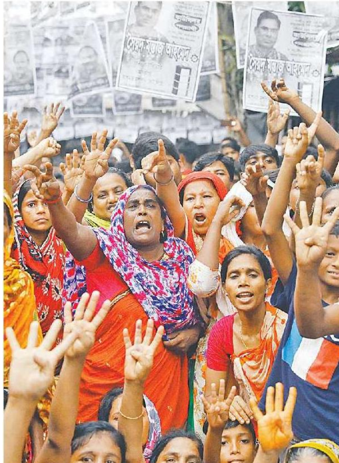
Voters are protesting in front of the Atkoshi Government Primary School polling centre in Rajshahi, after failing to cast their votes.