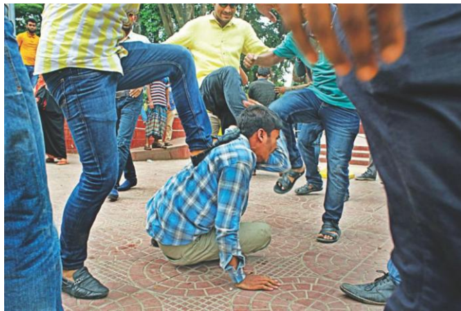
BCL men attacking other protesters and snatching their banner in Dhaka.