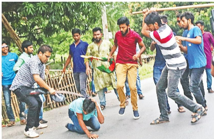
Demonstrators of the quota reform movement attacked by BCL leaders-activists, when they brought out protest rally in Rajshahi University campus.