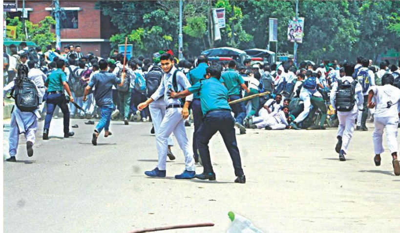
Police baton-charge students in Mirpur area of Dhaka City on 31 July 2018, when students of several colleges brought out the procession, demanding justice for the two college students who were killed in a road crash and for safe roads.