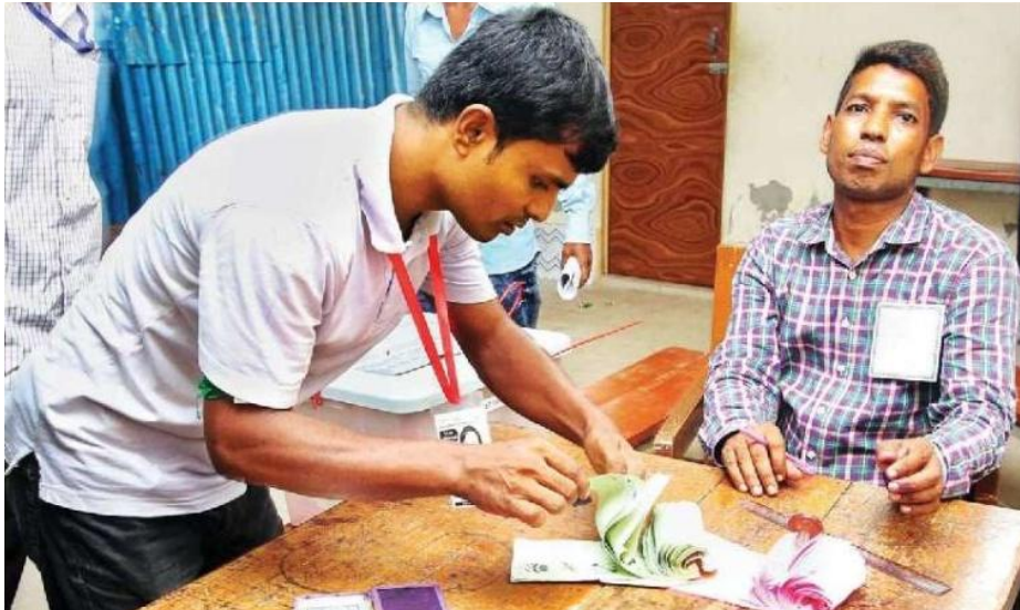
Chhatra League activists stamping ballots in Syed Majidunnesa High School polling centre during Barisal City Corporation poll held on 30 July 2018.