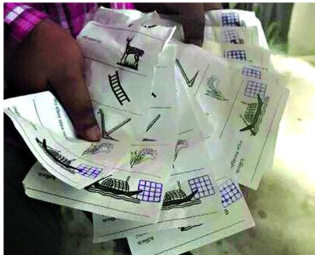
Stamped Awami League electoral symbol 'boat' on the ballots. Photo: Manabzamin, 31 July 2018