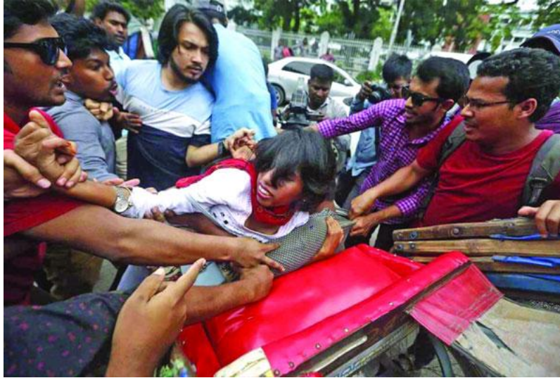
A woman demonstrator of the quota reform movement was being attacked by BCL activists in Dhaka. Photo: Bangladesh Protidin, 3 July 2018